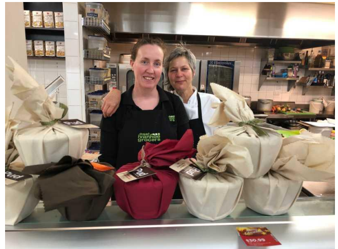
Photo below shows the latest range of Christmas puddings and the friendly staff waiting to serve you at the deli.

Local community support and indeed local sponsorship is incredibly important for small community clubs like ours. East Ivanhoe Foodworks has been supporting the Club for a number of years. This business is a Foodworks supermarket with a fantastic array of fresh foods and a huge range of pre-prepared, take-away meals. Their in house chef does a wonderful job preparing and cooking great meals that we have tried and loved, reminded us of a past holiday in New York and the classic New York deli! The business has won many awards for excellence and is a real gem in East Ivanhoe. Every $ spent by Ivanhoe Harriers supporters accrues 1 cent towards the Club, but you must mention Ivanhoe Harriers at the check-out. Please remember to go out of your way to support them as they support us.