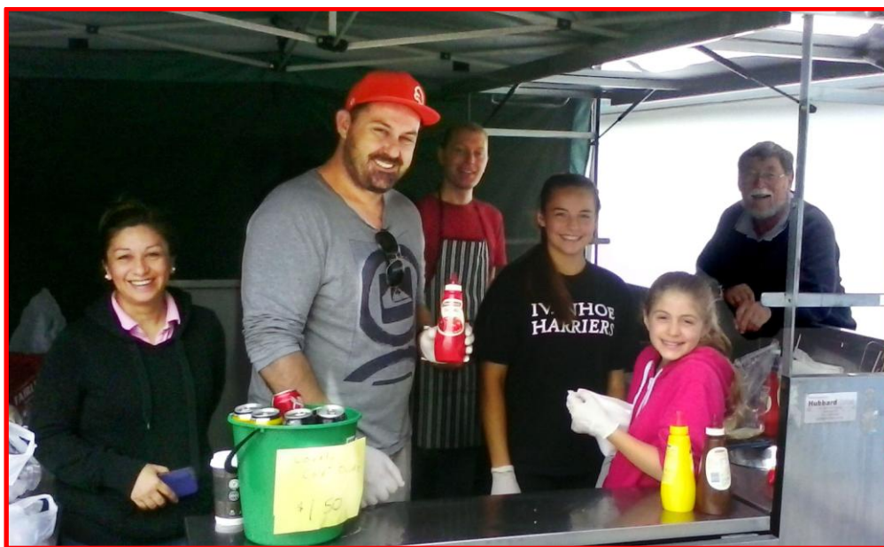
Helping out at the fund raising BBQ

It was also especially tough because of the hot weather conditions the day and night before and also being on a Sunday. Our great team were: